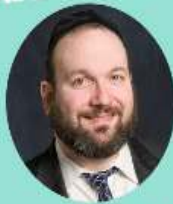
RABBI BARUCH SIMON