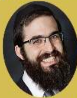
RABBI MOSHE WEINBERG